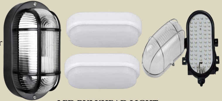
LED BULKHEAD LIGHT