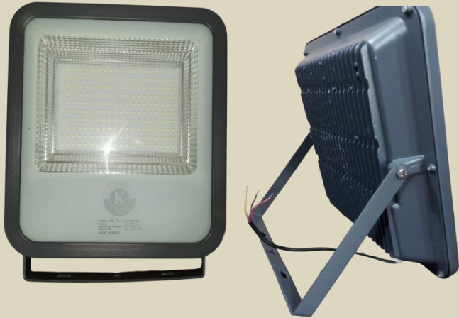
Energy Saving LED Smart/Flood Lights 50 to 400W