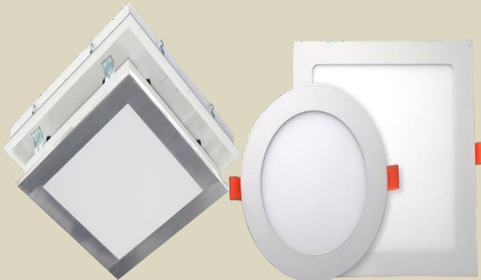
Back Light Panel & Slim Surface Panel 20 to 200 W