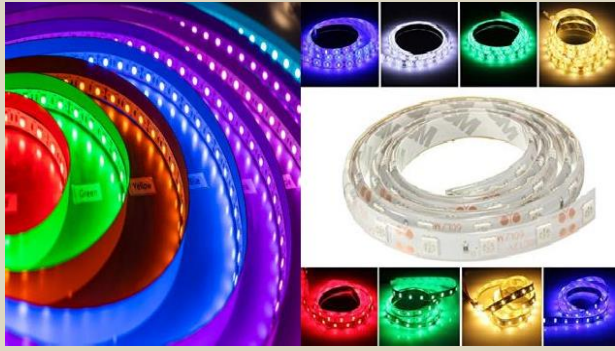
COB/LED Strip Lights