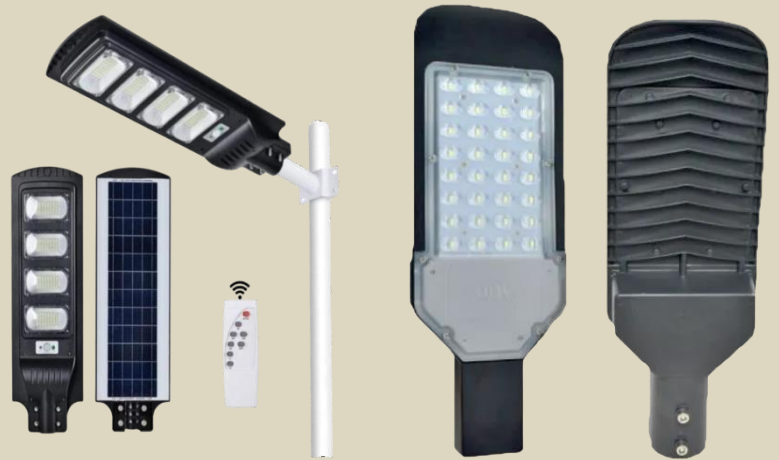
Integrated Solar Street Light (20 to 250 W) Lens Street Light